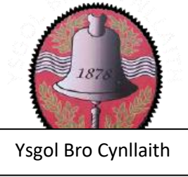
Ysgol Bro Cynllaith